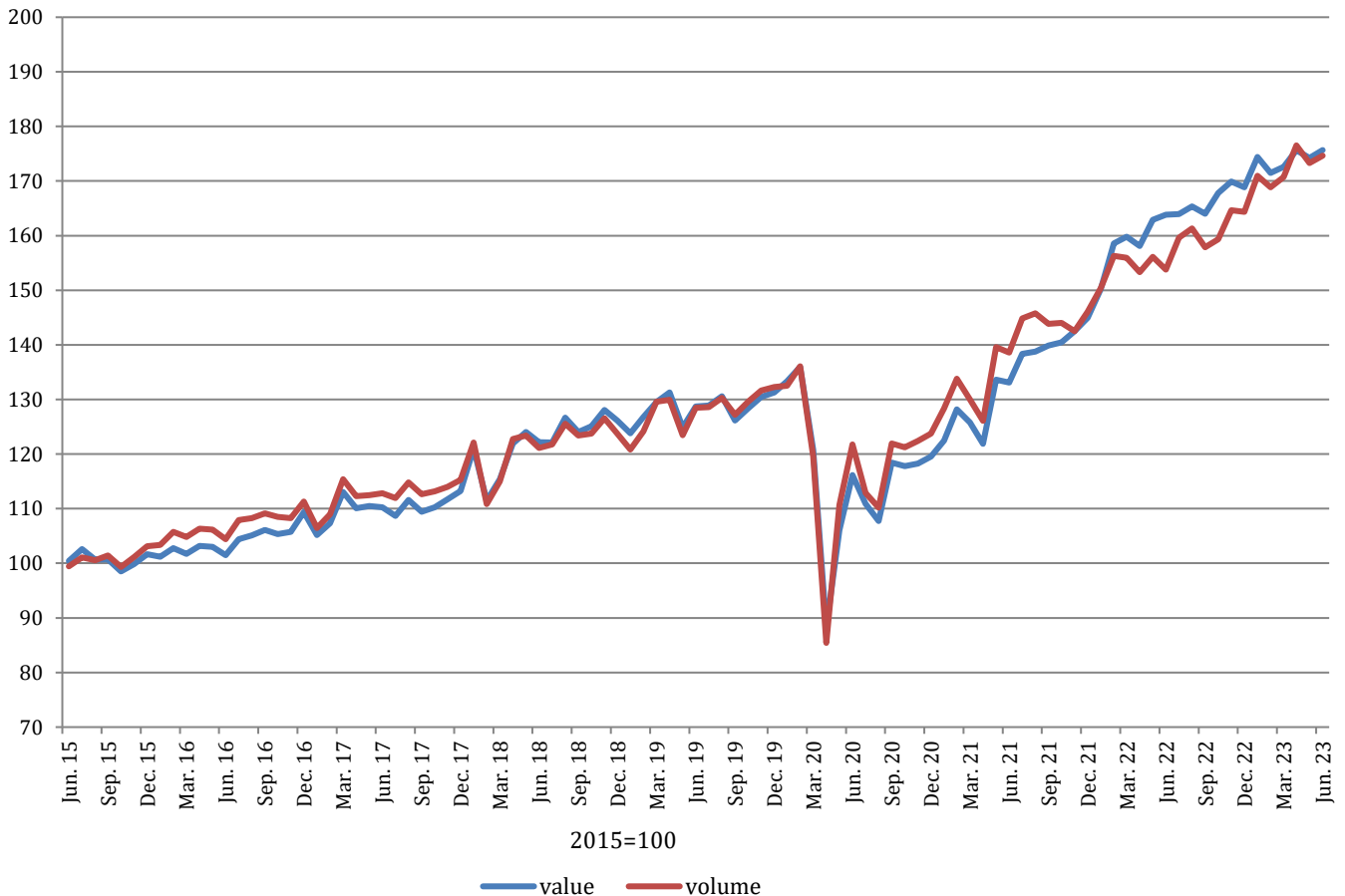
Indices of Retail Trade Turnover, seasonally adjusted series BiH, 2015=100