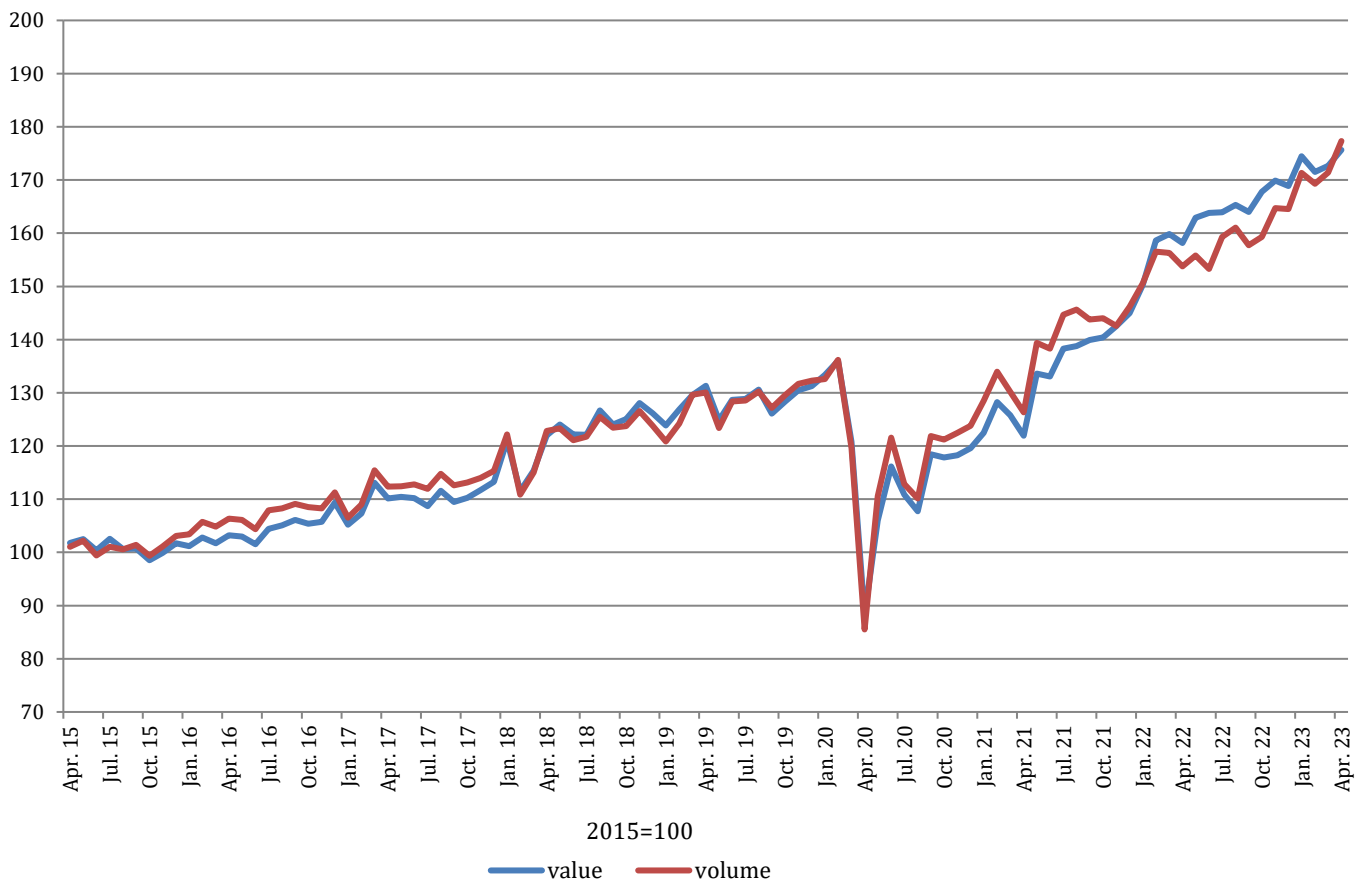
Indices of Retail Trade Turnover, seasonally adjusted series BiH, 2015=100