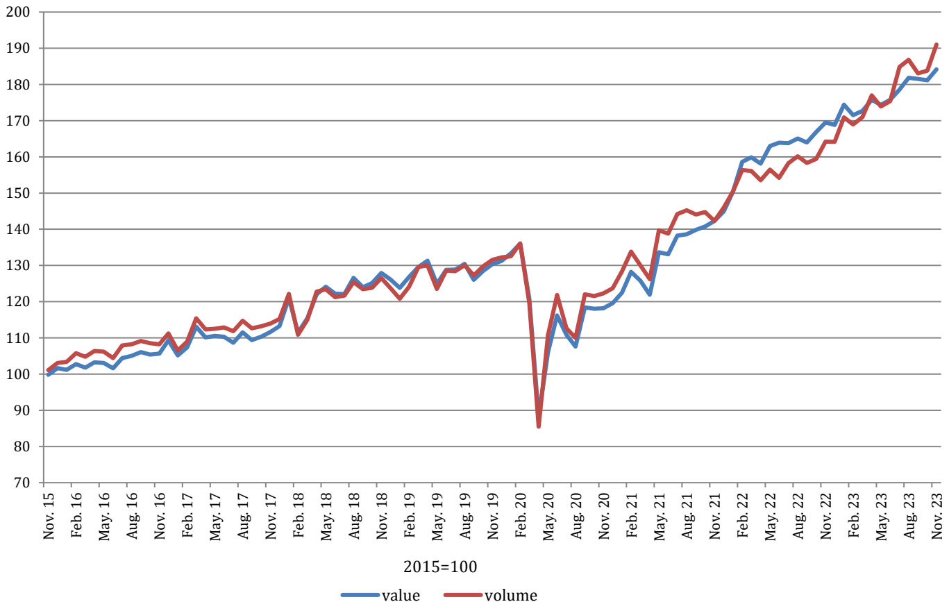
Indices of Retail Trade Turnover, seasonally adjusted series BiH, 2015=100