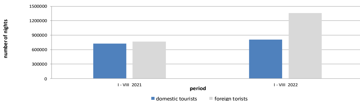
Tourists nights, January - August 2021 and 2022

According to the type of accommodation facility the highest number of nights was recorded in Hotels and similar accommodation with share of 93.3%.