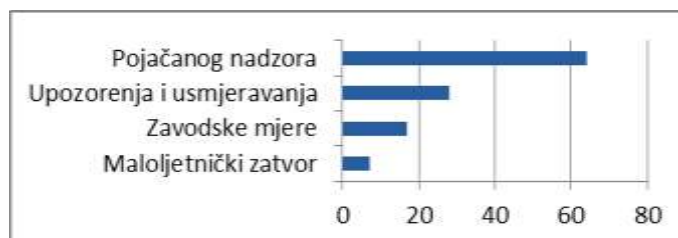
Grafikon 3. Izrečene krivične sankcije, 2019. godina Graph 3. Criminal sanctions imposed, year 2019