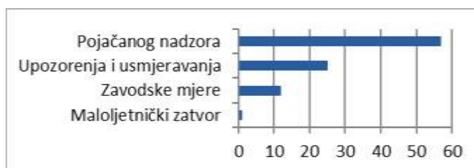
Grafikon 3. Izrečene krivične sankcije, 2018. godina Graph 3. Criminal sanctions imposed, year 2018